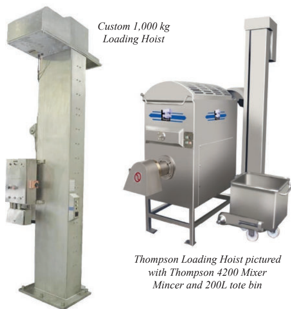
Custom 1,000 kg Loading Hoist

The Thompson Loading Hoist can be utilized for a variety of tipping applications and incorporated to feed many types of equipment. With Tipping Heights From 1 Metre Through To 3.9 Metres this series of Thompson Loading Hoist has been used to load Mixer Mincers, Filling Machines, Tumblers or simply in a Material Handling or Transfer Application .