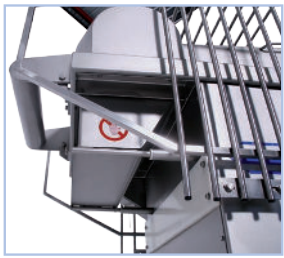
Discharge Chute with Guard

The Thompson Frozen Block Flaker is a heavy duty industrial machine specifically designed to process large volumes of frozen product. It is used extensively in many high production facilities worldwide. It is renowned for consistently delivering high performance and reliability .