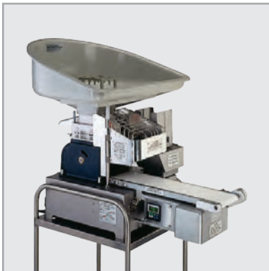
Super Portioning Machine with Programmable Counter and Conveyor