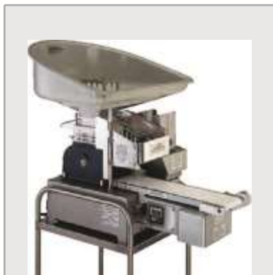
Super Portioning Machine with Programmable Counter and Conveyor

For more information contact Hollymatic or your local authorized Hollymatic Dealer today!