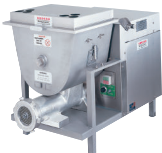
Mini-Matic Tabletop Mixer/Grinder