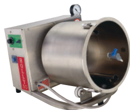
HVT-30 Vacuum Tumbler